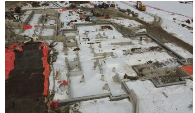
Overview of Work Progress