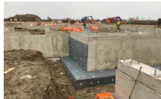
Insulation work around footings