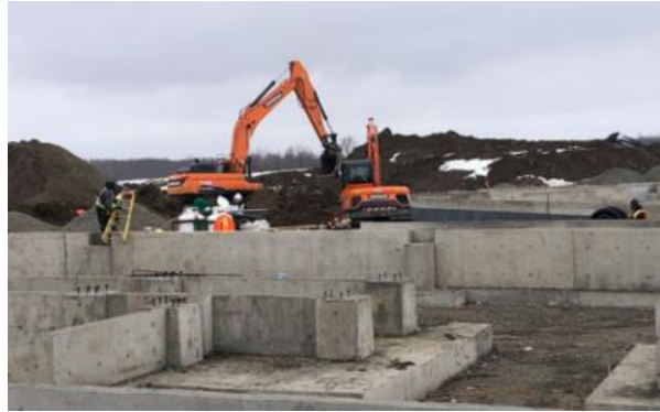
Foundation Works stripped in North / West wing