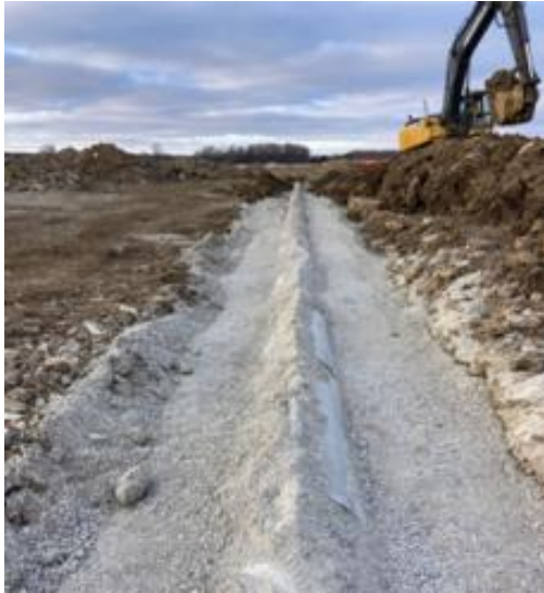
Septic Field Drainage & Storm water piping