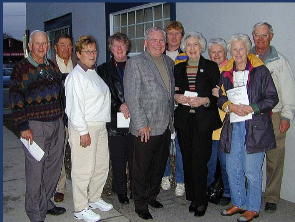
Our founding members after the decision